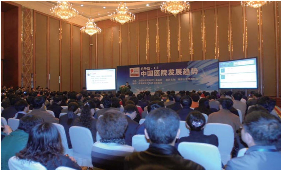
Hospital CEOs are Listening to Academic Report