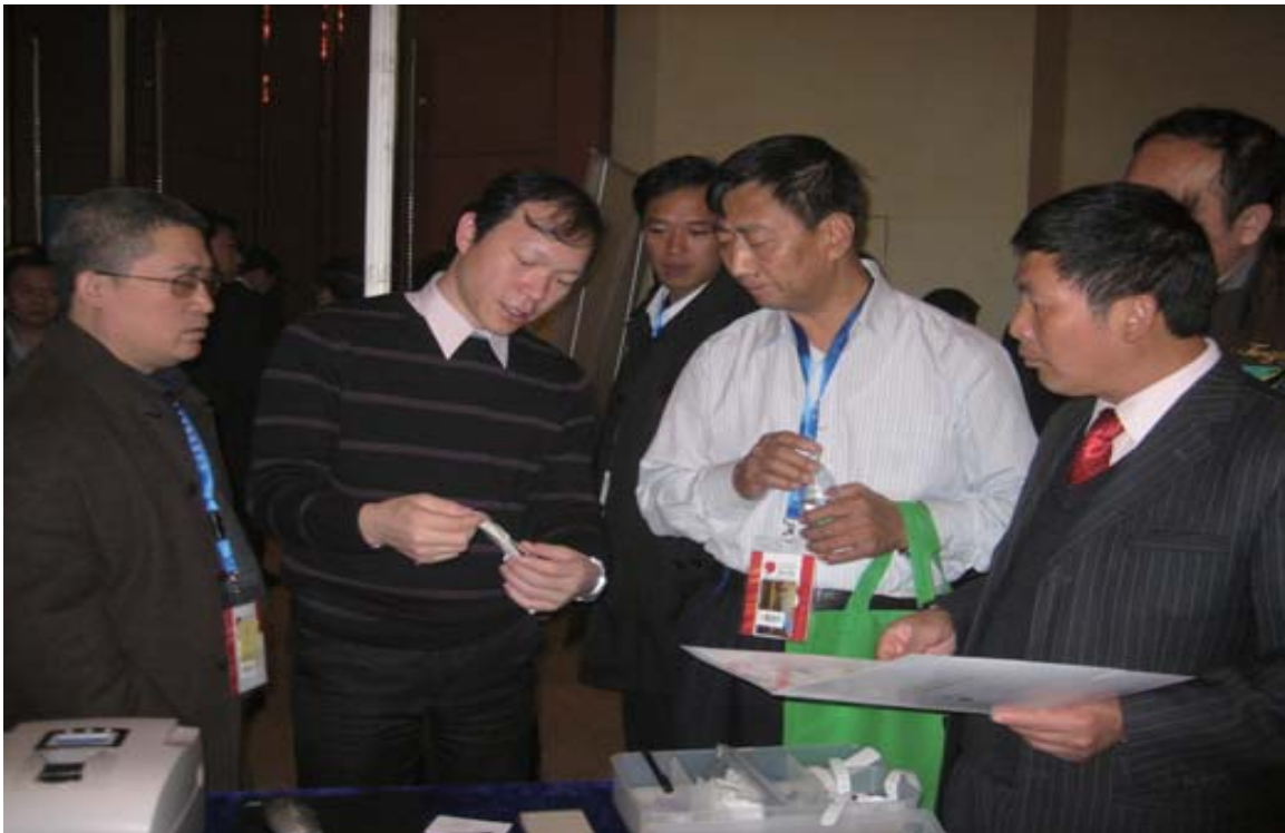
Introduce New Products Application to Hospital CEOs